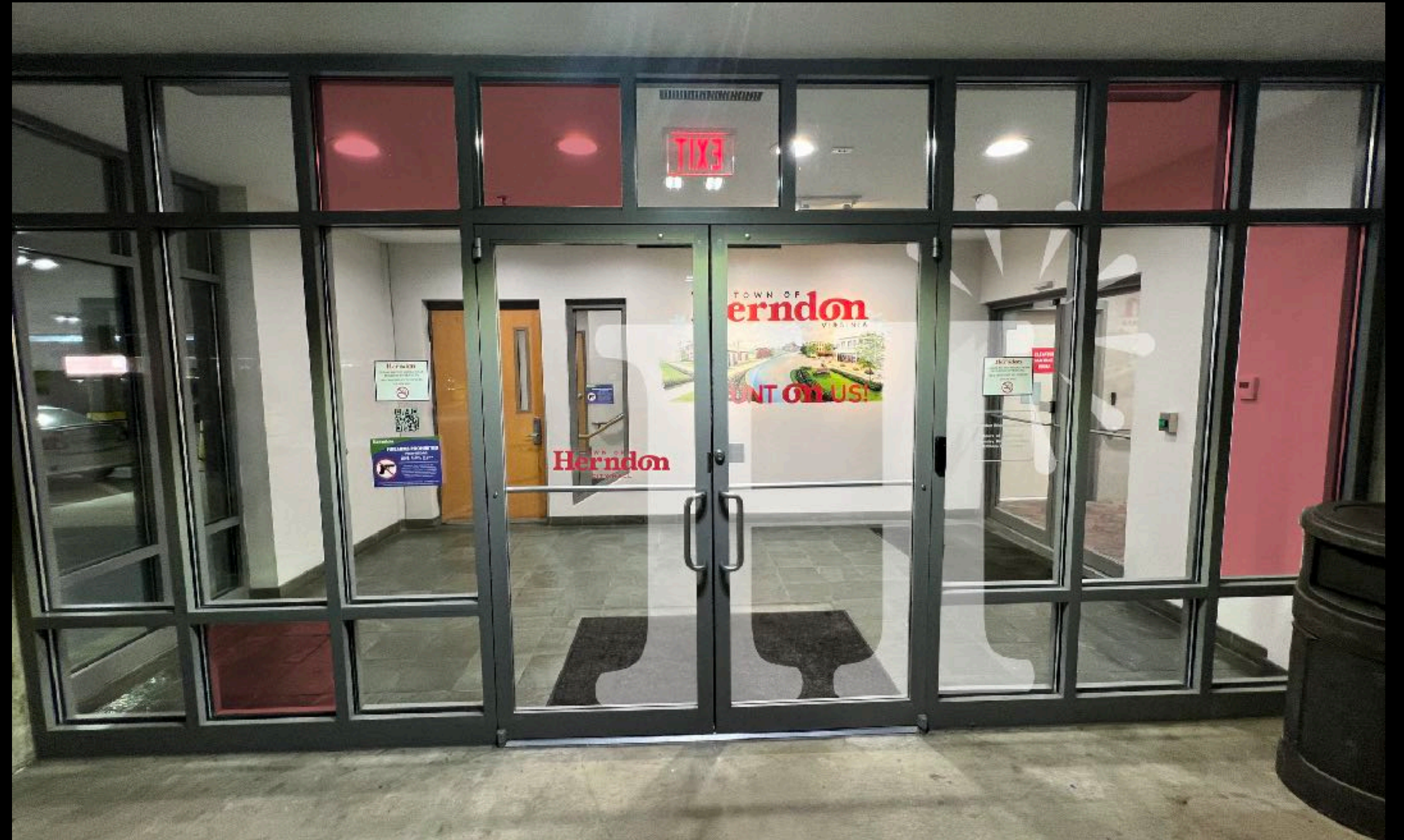
(Revised) City Hall Garage Entrance