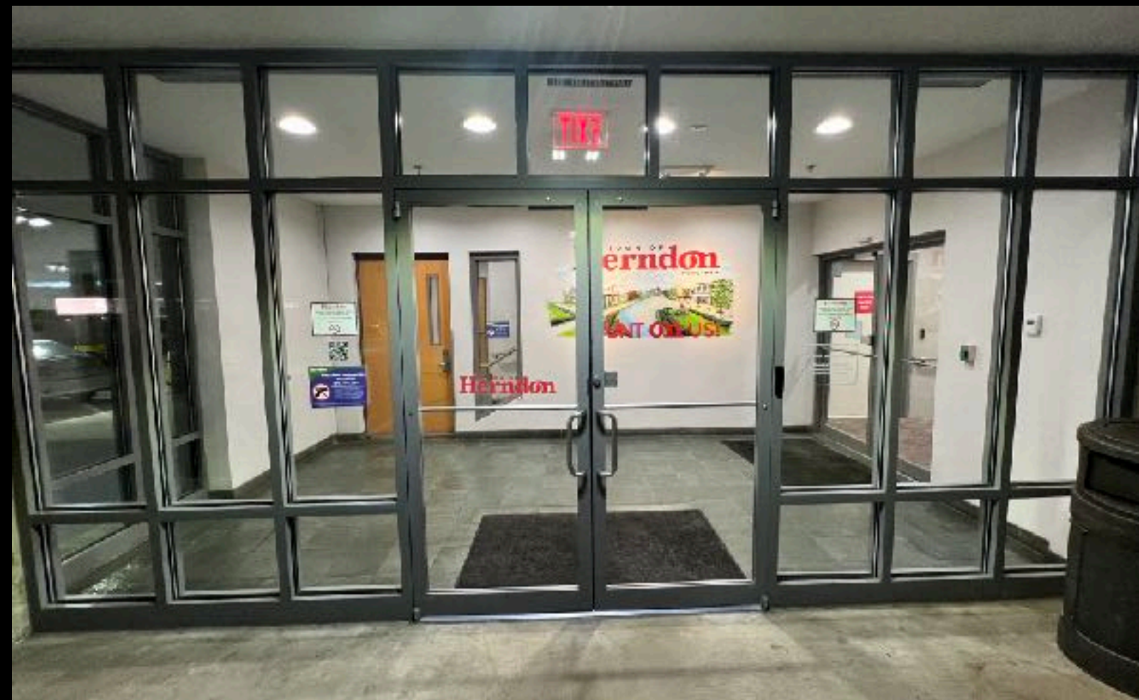
(Existing) City Hall Garage Entrance